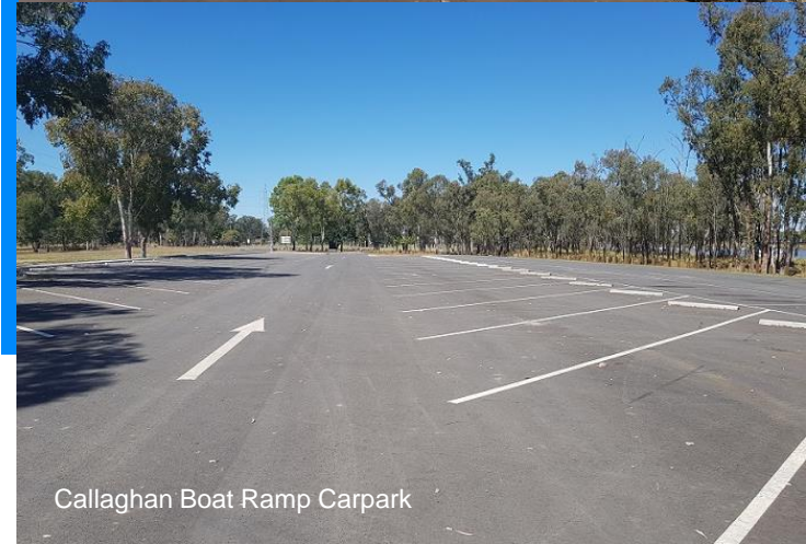
Callaghan Boat Ramp Carpark