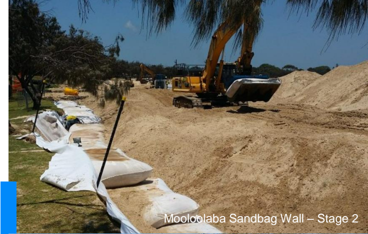
Mooloolaba Sandbag Wall – Stage 2