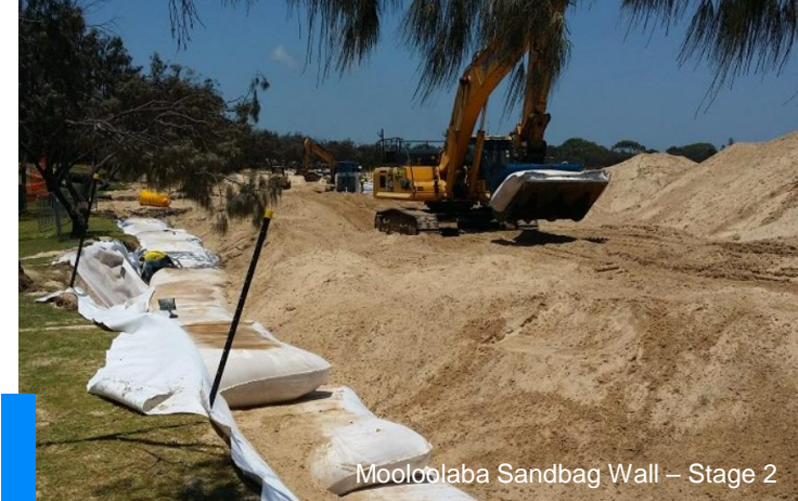
Mooloolaba Sandbag Wall – Stage 2