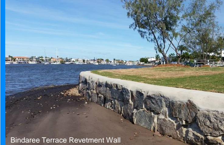
Bindaree Terrace Revetment Wall