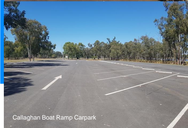
Callaghan Boat Ramp Carpark