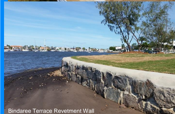
Bindaree Terrace Revetment Wall